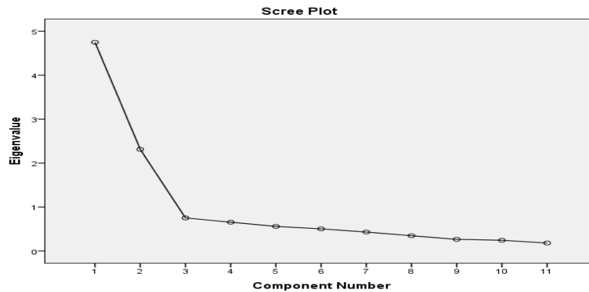
Figure 1. Eigenvalues Scree Plot

As shown in the factor analysis displayed in Table 5, the attitude items in the matrix loaded cleanly on two factors: cognitive and affective attitudes. The items of cognitive attitude ranged from .77 to .91, and the items of the affective construct ranged from .75 to .84: