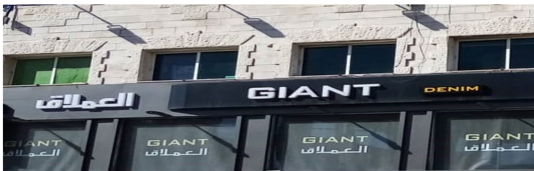
Figure 2. A Multilingual Duplicating Writing on the Front of a Clothing Company

Equally important, drawing upon the analysis model used by Reh (2004), the data were engaged with types of multilingual information, particularly the complementary and duplicating multilingual writings. For example, the practices of the model benefit in exploring diverse symbolic meanings of languages displayed on fashion signs. Duplicating writing refers to those practices in which exactly the same text is provided in more than one language, as in the case of Giant (see Figure 2), which indicates that both English and Arabic are equally important, that is, acknowledging the existence of multilingualism in the community and, in turn, emphasizing effective aspects of communicating the commercial message.