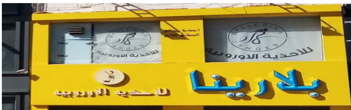
Figure 9. An Example of Complementary Writing Promoting an Italian Shoes Item

Despite the fact that Ballerina is an Italian lexical name for brand shoes visually displayed in Arabic, the product seems to symbolize all the European countries based on the occurrence of Arabic phrase للأحذية الأوربية ‘for European footwear’. The Arabicized Italian script in blue has been semiotically inscribed in larger-size fonts (see Figure 9) for perhaps stressing the impact of Italian commerce with regard to transferring and promoting footwear products and items in Jordan: