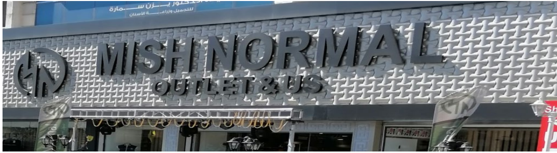
Figure 5. A Clothing Store Displaying a Complementary Bilingual Sign