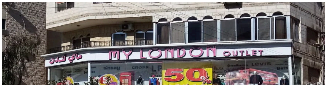
Figure 4. A Clothing Outlet Featuring Duplicating Writings of English-AE Pattern

The current language pattern, however, comprises fashion discourse signs that are originally printed in English and transliterated in Arabic. As seen in Figure 4, the Arabicization of the English clothing outlet My London outlet can be defined as a linguistic structure in which the same fashion name is provided in English and transliterated in Arabic, featuring duplicating multilingual writing as introduced by Reh (2004). According to Participant 1 (female professor aged 45), “In Jordan, English fashion signs often preserve their constant linguistic structure. No translation into the local language is introduced for such texts in the public space for encouraging the usage of the same business name in English and Arabic far and wide.” The use of English in such predominantly fashion areas is linked to the global drives of the language. Even though local viewers are capable of reading the Arabic script, its existence along the English code ( My London Outlet ) appears to be for maintaining and bolstering the global symbolic identity of the store, adding value to the products in other niches. There have been several other studies on the interconnection between the marketing and economic perspectives of products and their international linguistic connotations (Al-Naimat, 2015; Alomoush, 2015; Selvi, 2016).