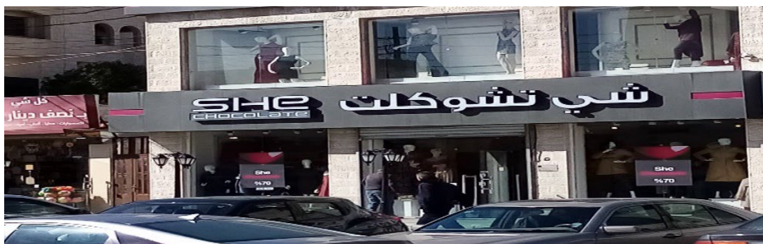
Figure 1. A Prime Example Showing the Geosemiotic Significance