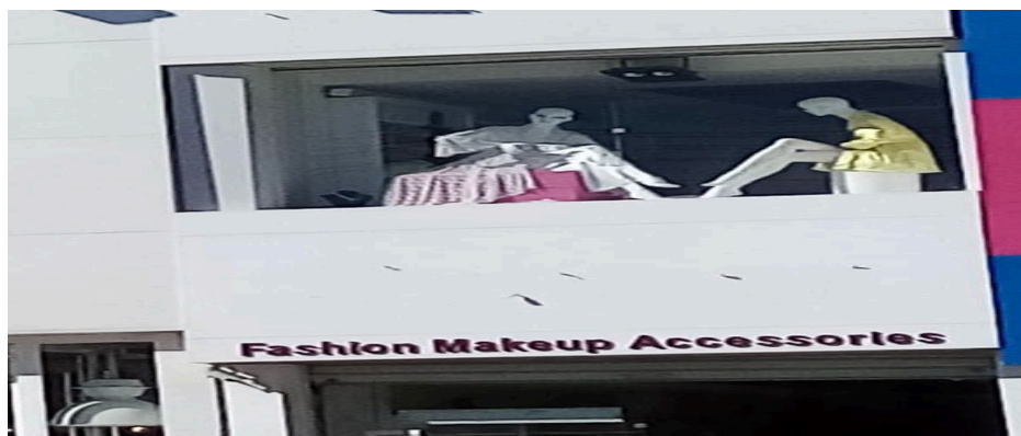
Figure 6. A Monolingual English Sign in Front of the Women's Accessories Store

in the local context. The symbolic function of LL features English for attaining strong possessions in the community (Landry & Bourhis, 1997). Further, based on our observations, we found that the sign makers employ semiotic modes other than English, such as images and colors. The preference for pink color for the English phrase contrasted with the white background also constructs an area of attraction (See Figure 6).