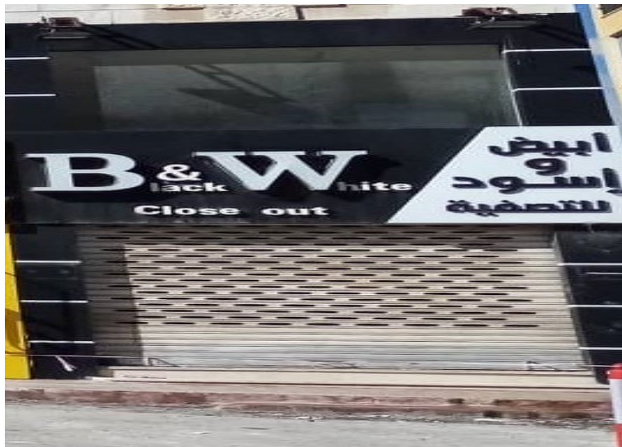
Figure 3. A Clothing Store Displaying Duplicating Writings of English and Arabic