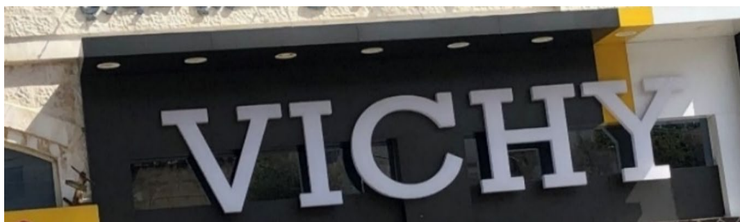
Figure 7. A French Sign Promoting a Beauty Product

Other language practices, including French, in equal terms to the larger quantity of English-only signs mentioned above, are found on 8 signs (29%) comprising beauty products such as Dior , Bioderma , and VICHY .